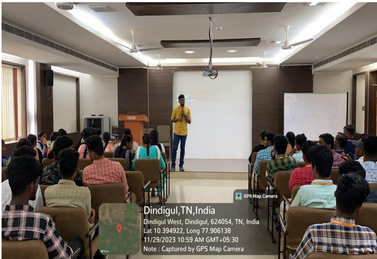
Chief Guest Sharing his Success Story to students