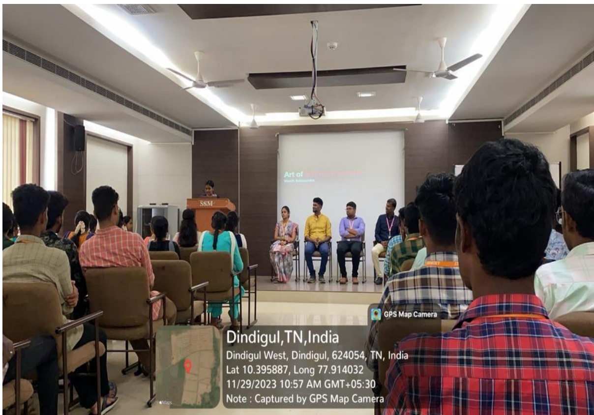
Chief Guest Introduction