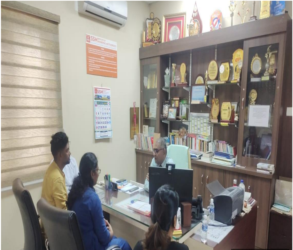
Discussion with Principal