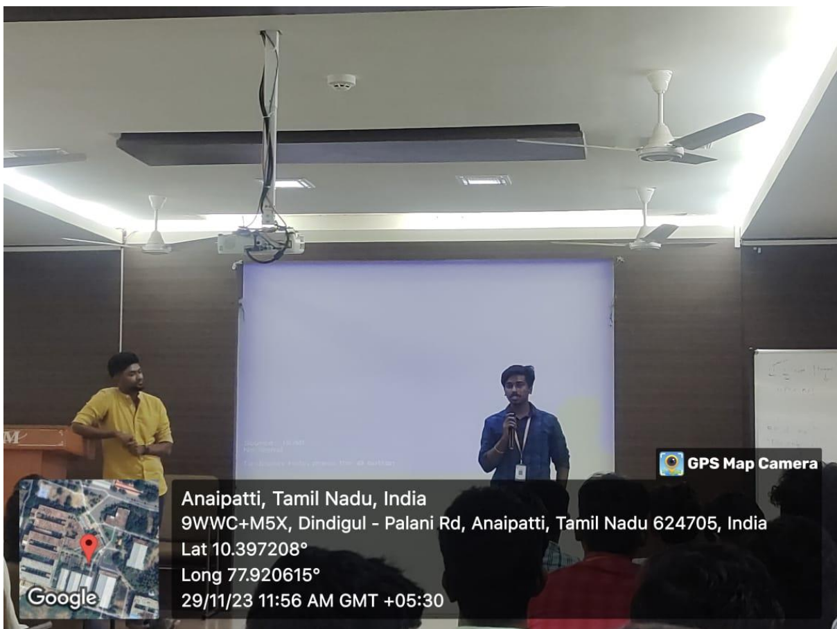
Participant sharing his innovative idea